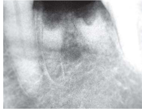
Fig. 12 -Initial radiograph illustrating radiopaque particles immediately after placement.

The use of Beta Tricalcium Phosphate materials with a biodegradable membrane barrier provides for a one step surgery, no potential for disease transmission, long term barrier function, no exposure issues and superior healing characteristics. The ability to evaluate the healing site radiographically is unique and a positive benefit. Following augmentation with Cerasorb material and covering with the appropriate membrane like Epi Guide, the bone loss of an extraction site is less than 10%. 1