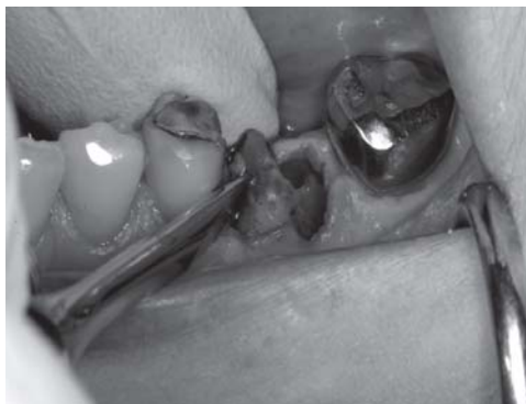
Fig. 3 - Elevator extraction of mesial and distal root.

Cerasorb (Reimser, Inc. Research Triangle Park, NC) is a Beta Tricalcium Phosphate product that has eleven years of clinical data behind it. It is an osteoconductive material with excellent porosity, predictable resorption, high phase purity, long term stability and maximum compatibility. The large primary particles prevent phagocytosis by macrophages and the high solubility of the material is adjusted to the natural formation of bone. The material, when initially placed, is radiopaque. As it scaffolds bone formation the material becomes more radiolucent and bone like. The Ceresorb granules are ingrown by bone cells and blood vessels and the material degrades with simultaneous bone replacement. There is, therefore, regeneration with vital new bone.