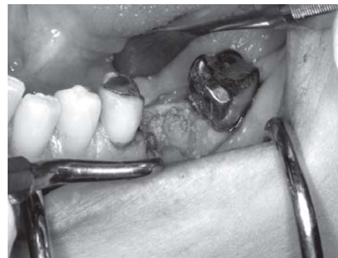
Fig. 10 -Particles packed into the socket site.