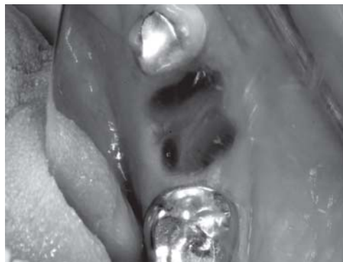
Fig. 4 - Mesial and distal socket following extraction of roots.