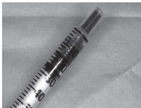
Fig. 8 - Adequate amount of blood harvested to wet the Tricalcium Phosphate particles.