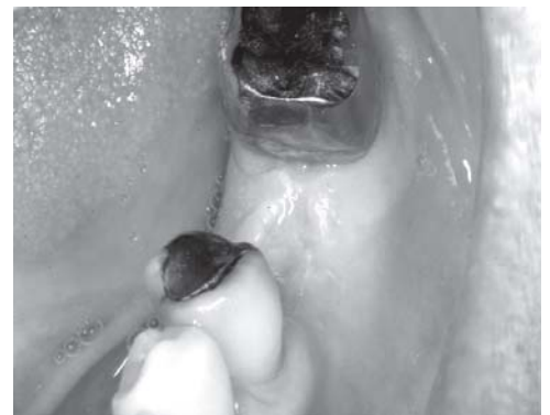
Fig. 14 - The ridge healed after 3 months.