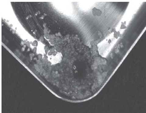
Fig. 9 -Mixing the Curesan particles with the patient's own blood.

Membranes are a critical part of bone augmentation procedures. New bone formation is enhanced by the additional use of a membrane under a periosteal lined mucoperiosteal flap. Ideal materials today can be bioresorbable, are exclusive of unwanted soft tissue epithelium, they support and protect clot formation, are space creating and protect the periodontal support tissues. They localize growth factors for bone cell production. Epi Guide membrane (Reimser Inc. Research Triangle Park, NC) has up to 20 weeks of functionality, provides self supporting structural integrity and has excellent fluid blood uptake into the matrix for clot formation and support. It is a D, D-L, L polylactic acid polymer that has a long history of safe medical use.