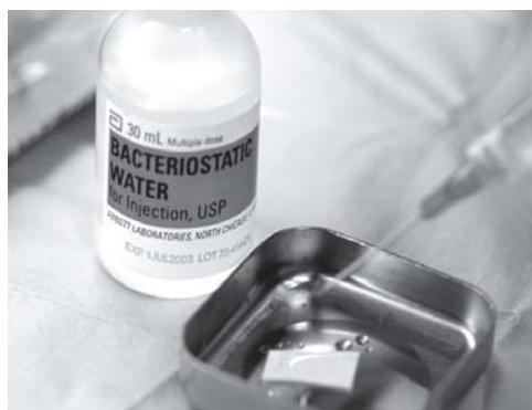
Fig. 6 - Epi Guide material being soaked with bacteriostatic sterile water.