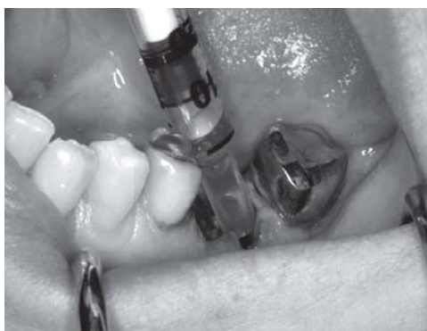
Fig. 7 - Syringing of blood from the socket site.