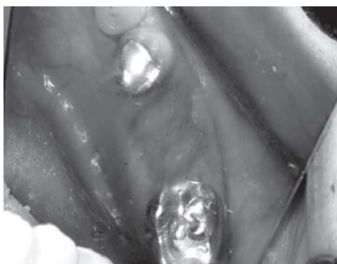
Fig. 11 - Suturing over the Epi Guide barrier.