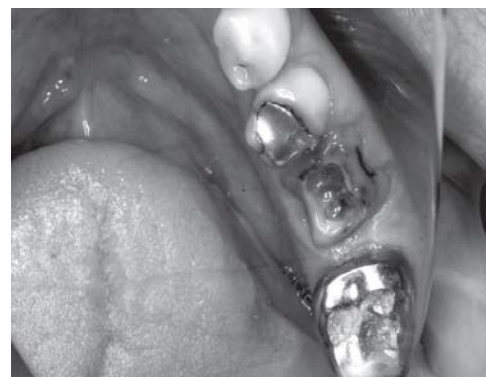
Fig. 2 - Occlusal view of fractured mandibular first molar.