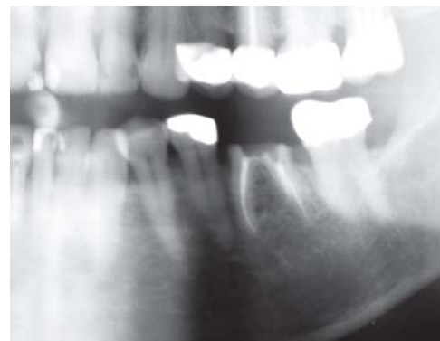
Fig. 1 - Preoperative radiograph illustrating non restorable mandibular left mandibular first molar.

There are many materials on the market today that are used during socket preservation procedures. The general categories of bone augmentation materials are autogenous, allografts, xenografts and alloplastic materials. Autogenous graft materials are certainly the "golden" standard. It is harvested from the patient's own body but requires a second surgical site for harvesting of material. Often these sites are the symphysis or ramus. Therefore the material is limited in supply and there is added time for processing and healing of two sites, potential surgical morbidity and an increased chair side procedure time.